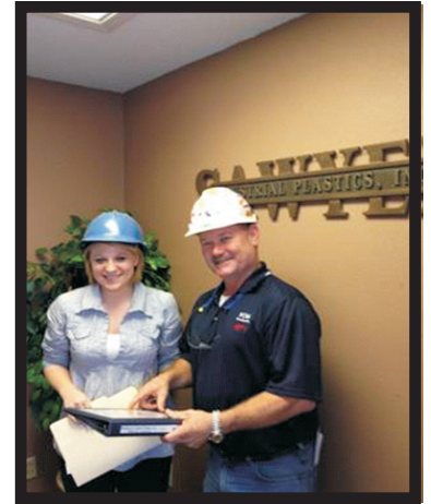
Inside sign materials

UV stabilized Will not swell Easily Cleaned Graffiti resistant Resists Scratches Will not delaminate Will not crack or chip Never Needs painting Rhos & REACH compliant