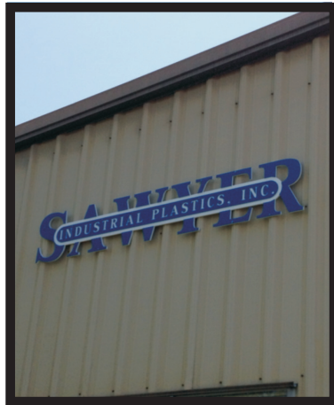
Outside sign materials